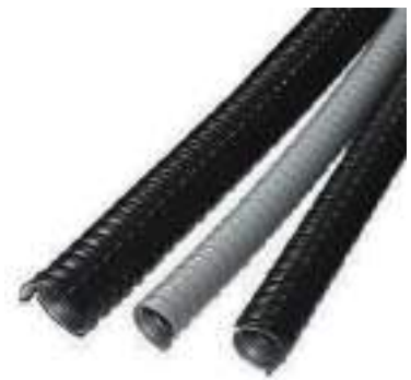
LIQUID TIGHT CONDUITS