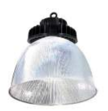
High Bay Light