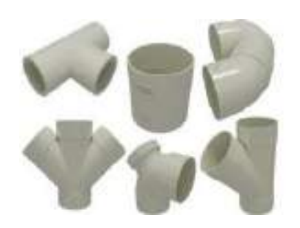
PVC Y & BENDS