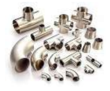
S. STEEL FITTINGS