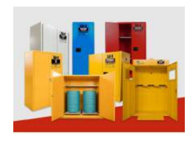
FLAMMABLE STORAGE CABINETS