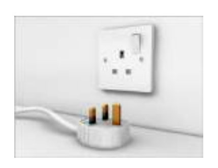
Plugs / Sockets 13A