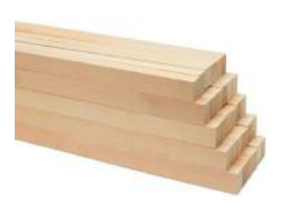
SQUARE WOOD BARS