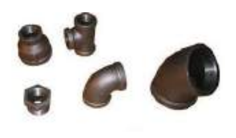
MALLEABLE IRON FITTINGS